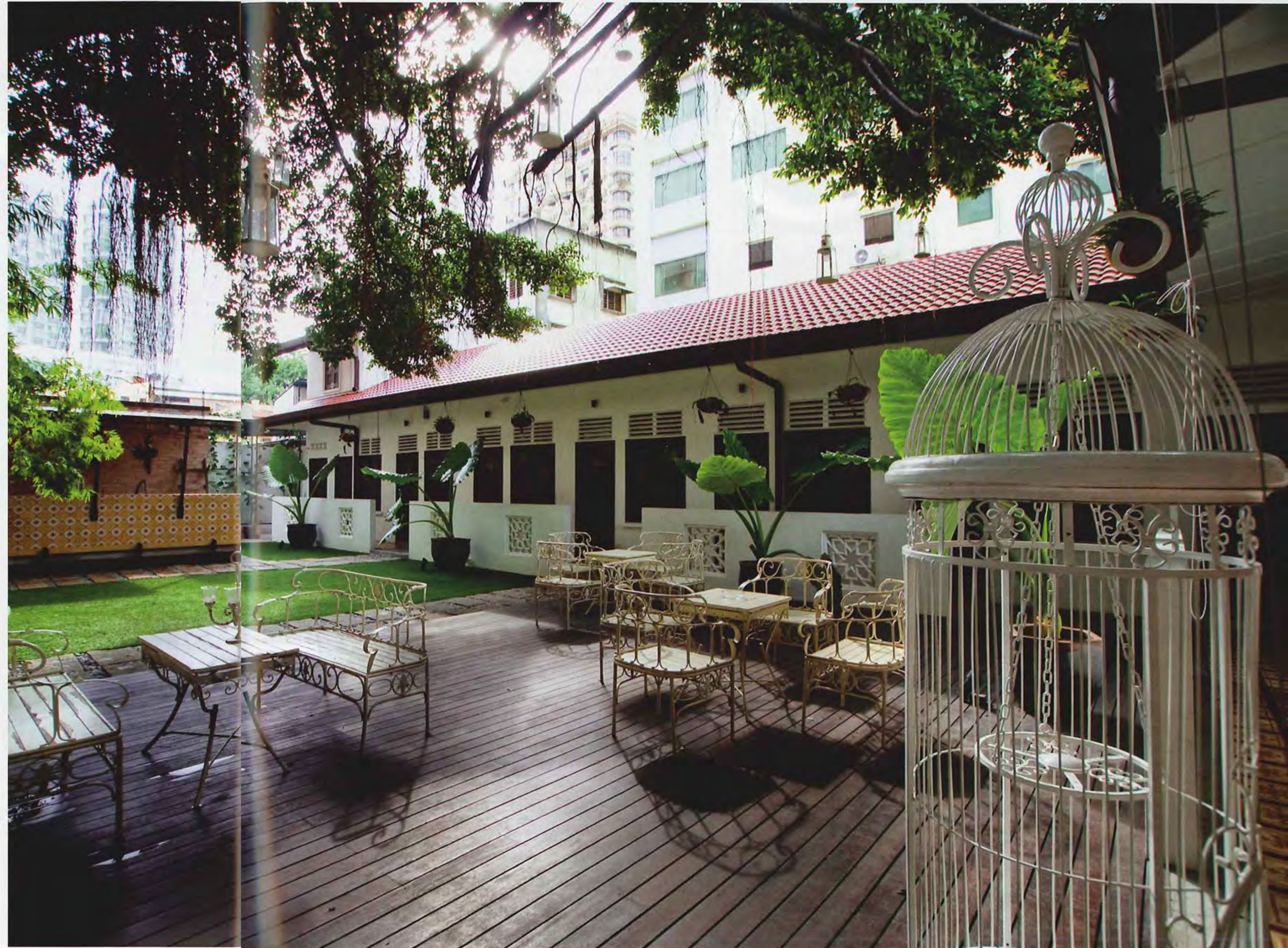
➡ The rooms look out into the airy courtyard, with the main feature being the 50-year-old ficus tree.