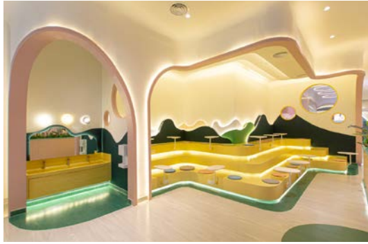
Below: Children's playground area.