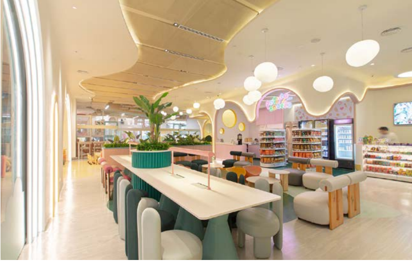
Above: Parent's lounge and snack corner view.